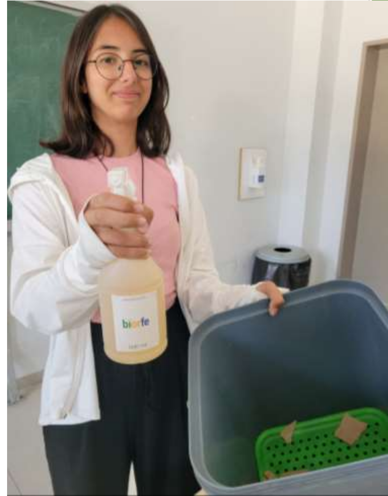
Ph conditioner liquid