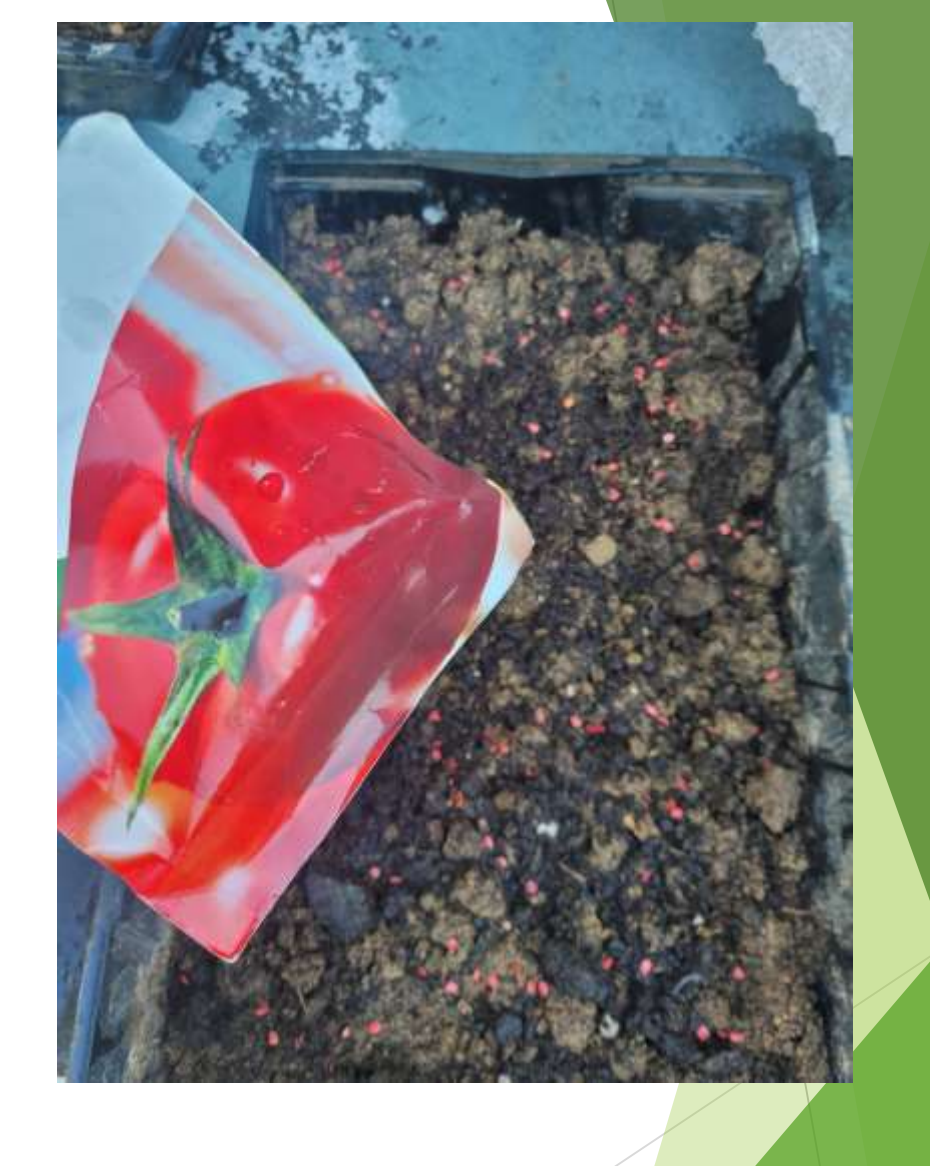
Your soil is ready to use!