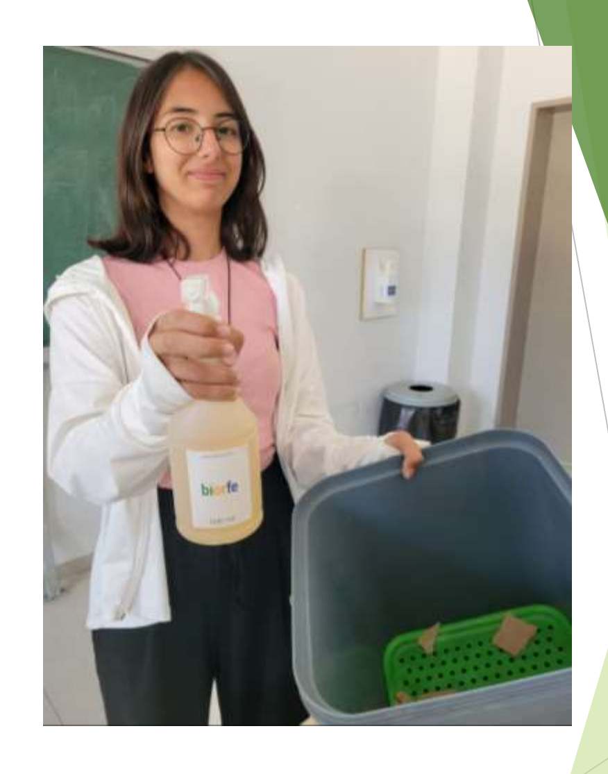
Ph conditioner liquid