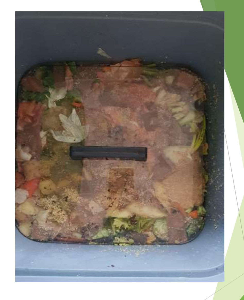
two weeks later